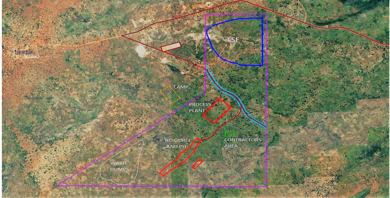
Figure. Mine layout and design showing location of the Mining Pits and waste dumps and mine infrastructure locations for plant ore stockpile, tailings storage facility, water storage dam and permanent camp

The objective of the Balama Central Scoping Study was to validate the decision to move into an immediate Feasibility Study, inclusive of environmental and mining concession applications, which is expected to be completed mid-2018.