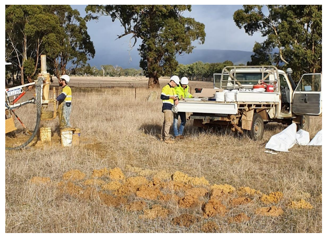
Figure 4: Drilling Crew and Exploration Team in Action.