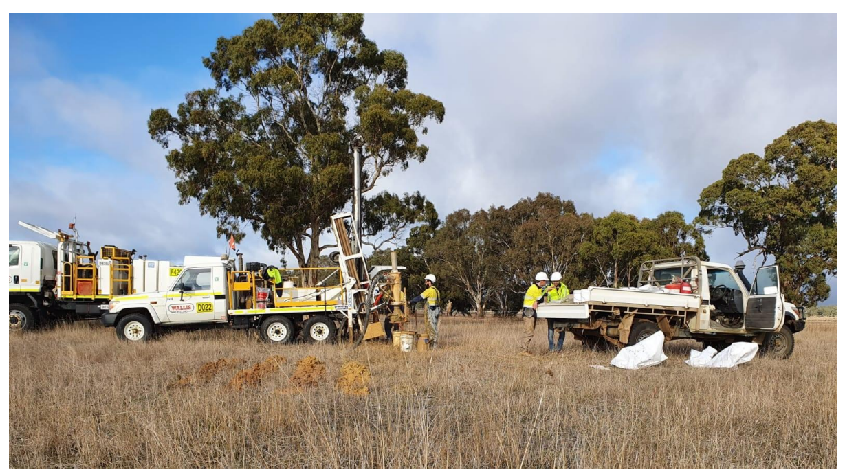
Figure 3: Drilling Crew and Exploration Team in Action.